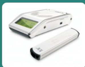
QA Services for Radiology equipment as per AERB Guidelines