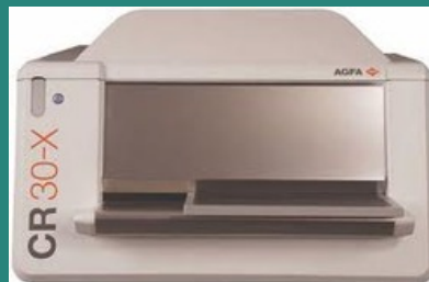
CR-30X Computed Radiography