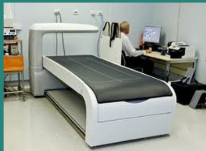
BMD DEXA Ge Lunar Prodigy Series Scanner