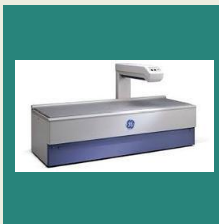
Bmd DEXA Ge Lunar Dpx Series Scanner