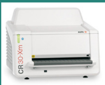
CR-30Xm Computed Radiography