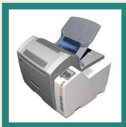
Drystar Axys Dry Imagers