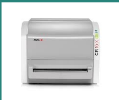
CR-10X Computed Radiography