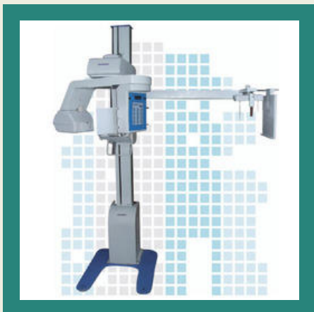
OPG 3000 Panoramic System