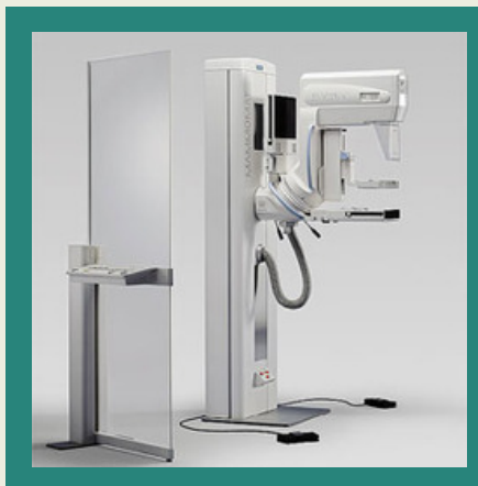
Siemens Mammomat 3000 Nova Mammography System